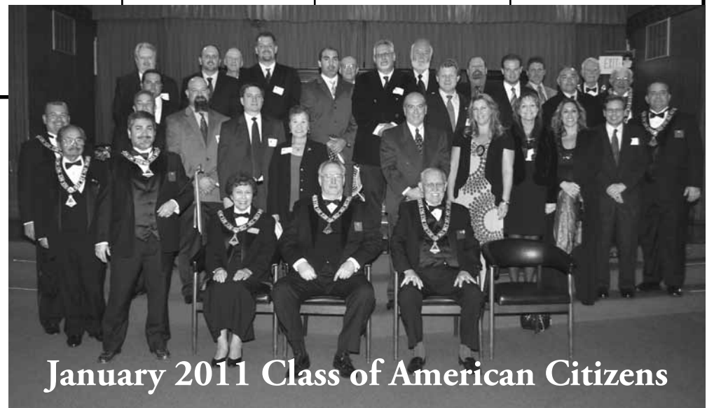
January 2011 Class of American Citizens