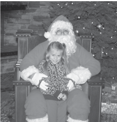
Santa Claus Visits the Childrens Christmas Party