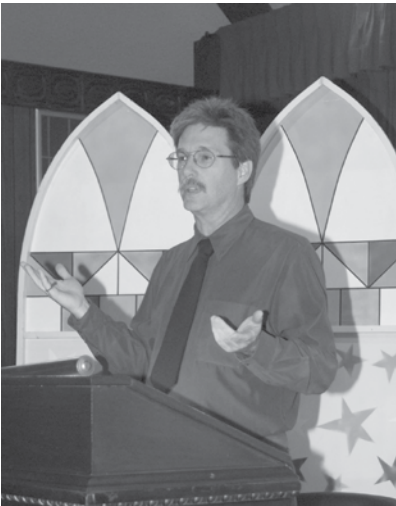
Elks Memorial Service